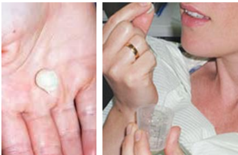
Fig. 2 The paraffin cube and the graduated container

Salivary flow is the result of the salivary secretion rate that we can distinguish in: