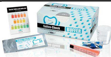
Fig. 1 Saliva Check BUFFER Kit

Saliva testing involves visually inspecting the salivary level by assessing salivary gland secretion, saliva consistency, as indicated by the test company, and salivary pH measurement. This test includes specific paper for salivary pH testing and a graduated specific saliva collection tray. The normal salivary phage indicating a healthy saliva is between 6.8-7.8 (Aleksejuniene et al. , 2007; Coulter and Walsh, 2006).